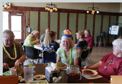
Large & Small Groups